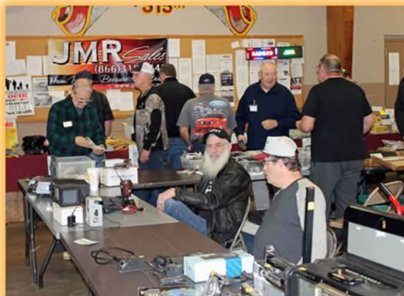
Floor flea market