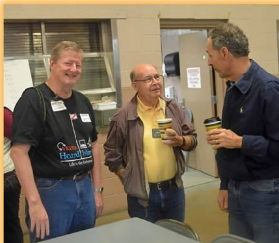
The DX'er Gang